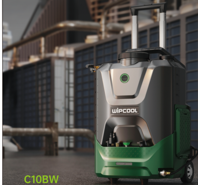
C10BW Integrated Coil Cleaning Machine -Operation Manual