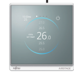
Wired remote controller