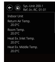
Display screen example