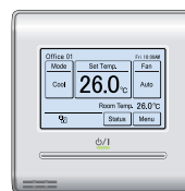
LCD Touch Panel Controller UTY-RNRYT5